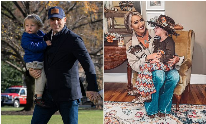
Hunter Biden told to face judge or land in JAIL in child support case