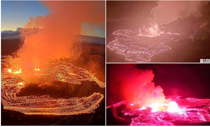
Kilauea volcano on Hawaii's Big Island erupts