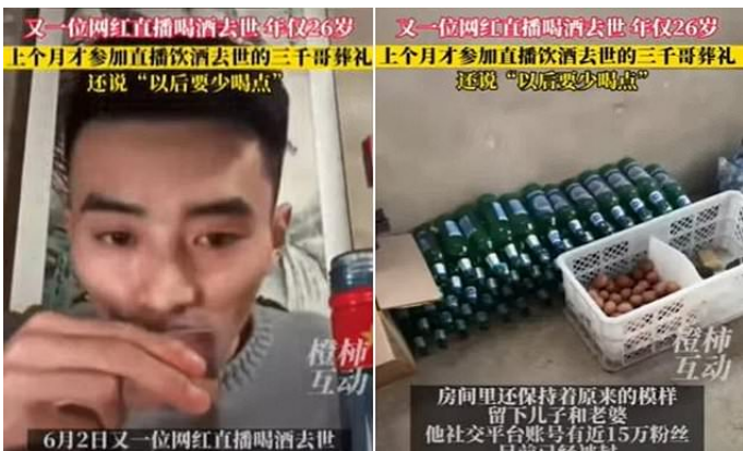
Second Chinese influencer dies after online drinking challenge